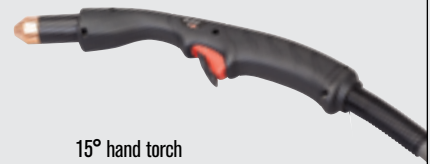
15° hand torch