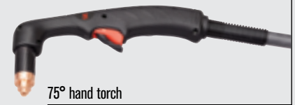
75° hand torch

Duramax standard torch styles (for more torch options, see www.hypertherm.com )